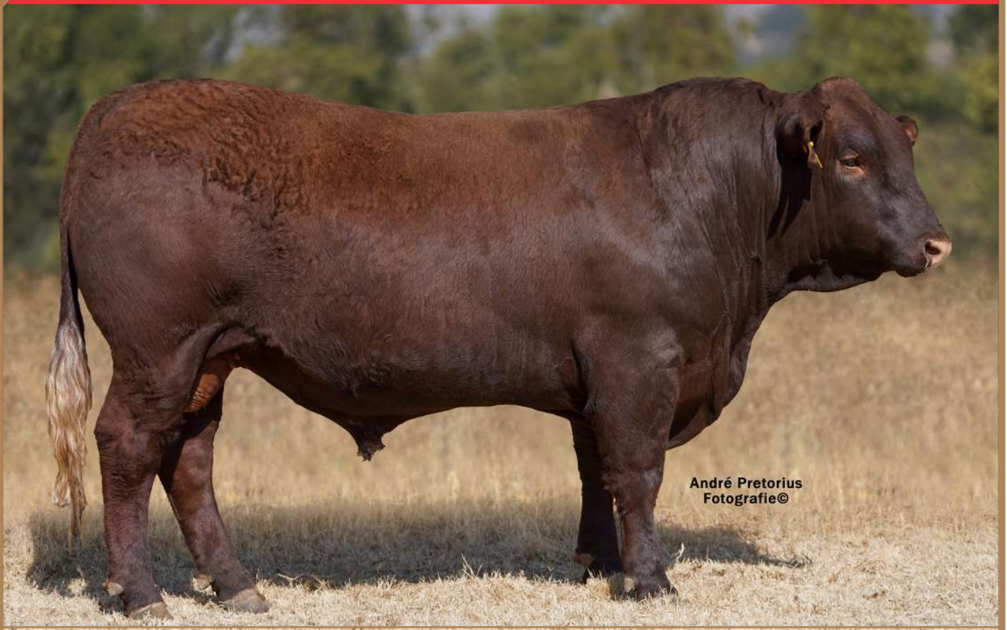
André Pretorius Fotografie©