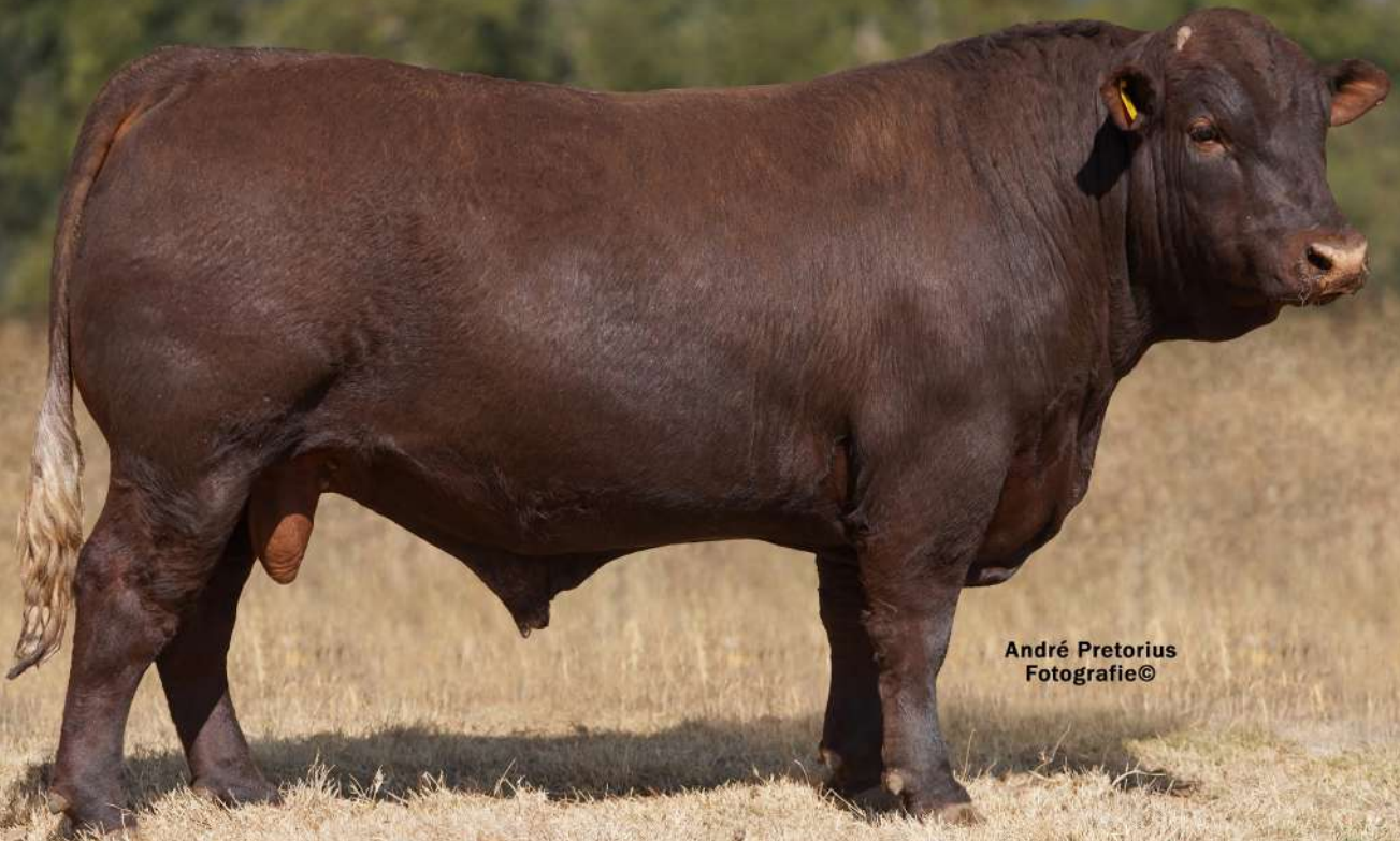
André Pretorius Fotografie©