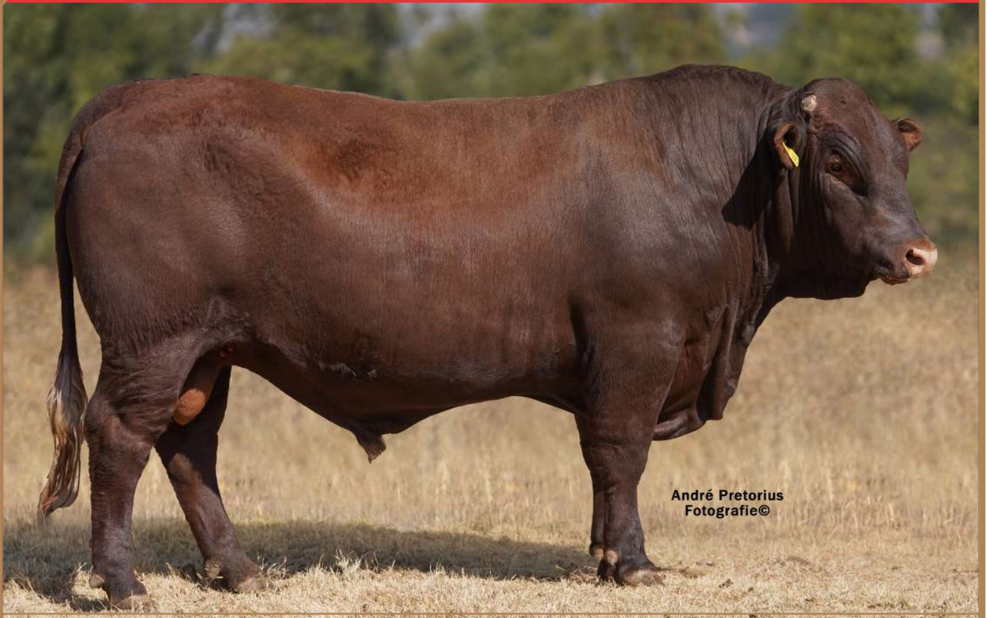
André Pretorius Fotografie©