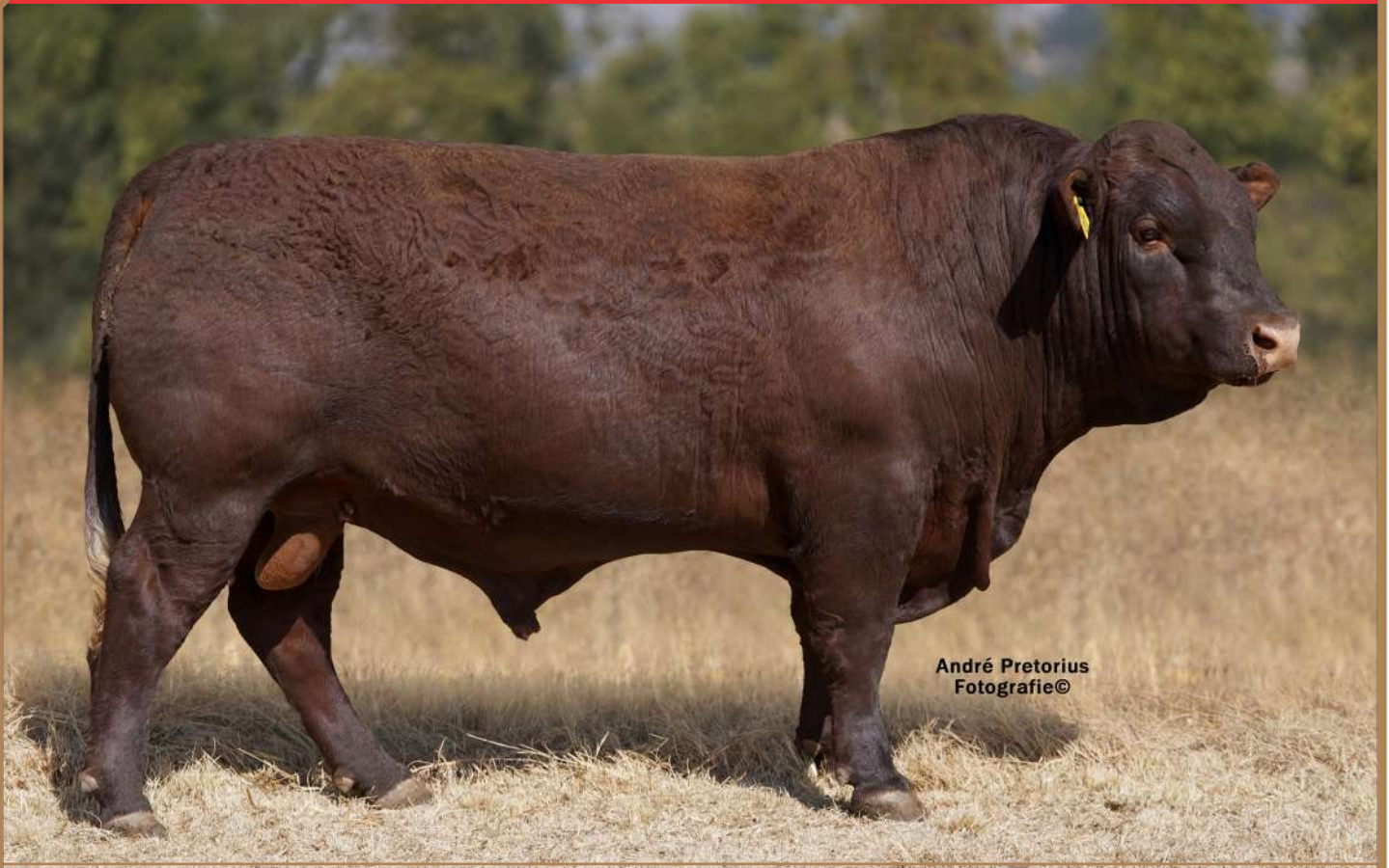
André Pretorius Fotografie©