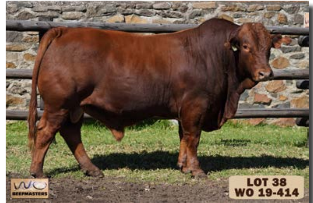
LOT 38 WO 19-414