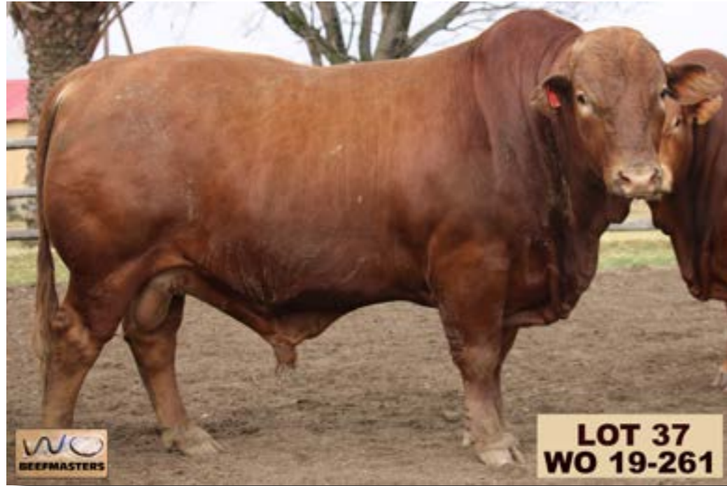
LOT 37 WO 19-261